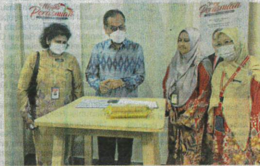
Dr Dzulkefly menandatangani buku pelawat selepas merasmikan Klinik Kesihatan Air Putih di Balik Pulau pada Jumaat.

Menurut Dr Dzulkefly, jumlah itu menunjukkan tidak ramal pelajar yang berminat dalam bi-