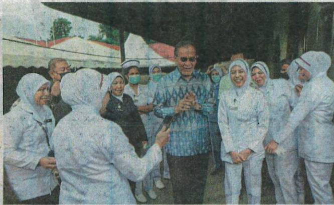
Nice to meet you: Dzulkefly being greeted by nurses at the Bayan Lepas Health Clinic in Bayan Lepas, Penang.

BALIK PULAU: The draft amendment to the Medical Act 1971 to address the gap between the parallel pathway and local Master's medical programmes has been submitted to the Attorney General's Chambers (AGC) for a review, says Datuk Seri Dr Dzulkefly Ahmad. The Health Minister said engagement sessions would also be held with stakeholders, including the Malaysian Medical Council (MMC), Malaysian Qualifications Agency (MQA), and Higher Education Ministry. "The amendment has been submitted to the AGC for a review. "And before that, we will have engagement sessions with stakeholders. "Once that is all completed, we will present the amendment to the Cabinet with the hope the Bill