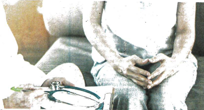
Pegesanan pada peringkat awal jangkitan virus HPV penting bagi mencegah penularan kanser pangkal rahim. (Foto hiasan)

Dr Nur Balqis berkata, bagaimanapun menurut laporan Tinjauan Kaji Selidik Morbiditi Kebangsaan pada 2019, kurang daripada 40 peratus wanita Malaysia menjalani pemeriksaan saringan ini sepanjang tempoh tiga tahun sebelum tinjauan itu. Ini bermakna hanya sebilangan kecil wanita Malaysia menjalani saringan ini secara berkala.