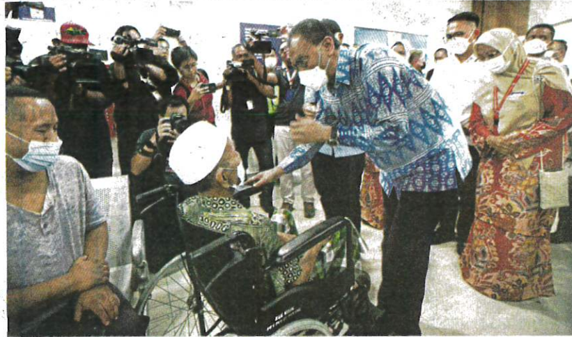
Dr Dzulkefly beramah mesra dengan pesakit ketika mengadakan lawatan ke Klinik Kesihatan Air Putih, Balik Pulau, semalam.

AKHBAR : BERITA HARIAN MUKA SURAT : 2 RUANGAN : NASIONAL