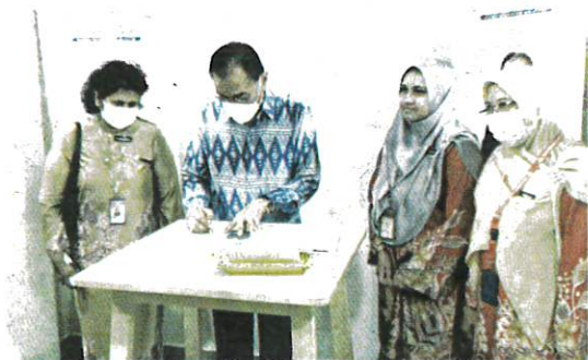
DZULKEFLY menandatangani buku lawatan ketika melawat Klinik Kesihatan Air Putih di Balik Pulau semalam.

BALIK PULAU – Klinik Kesihatan (Jenis 3) Air Putih, di sini yang siap pada 31 Oktober 2023 dengan kos RM30 juta telah beroperasi sepenuhnya Februari lalu.